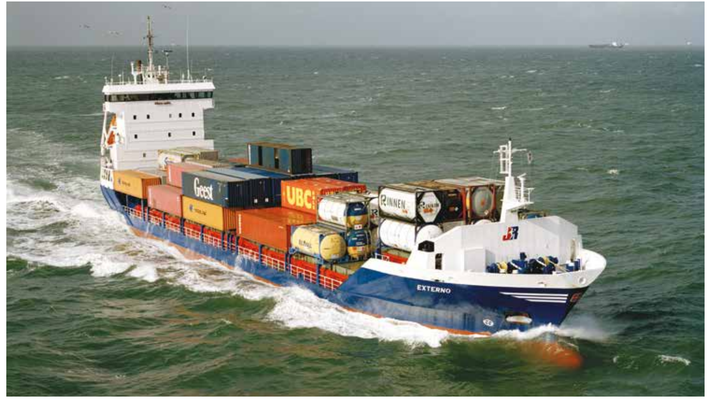
Container vessels with excellent properties and a high service speed. Builder: Scheepswerf Bijlsma in 2001.